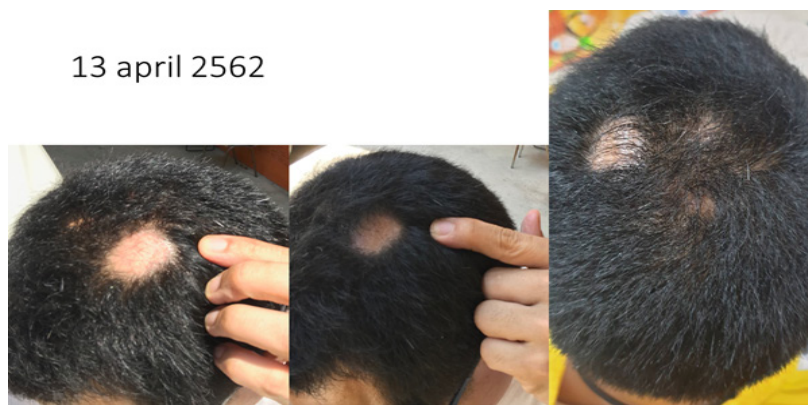
Figure 1 The first alopecia areata occurred, fast hair falling within 2-3 days (April 13th, 2019.)

Notes: The area of hair loss rapidly disappeared in 3 wide areas within 3 days; about 4 cm., 3.5 cm., and 3 cm. in diameter respectively