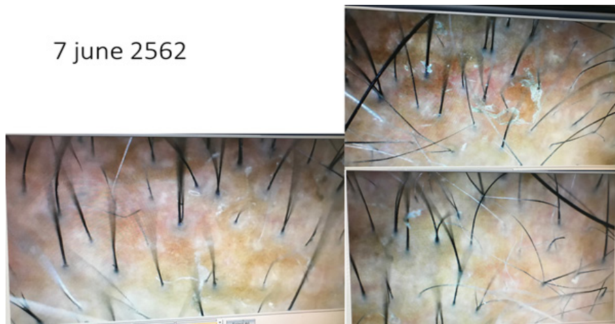
Figure 2 After applying extracted cannabis oil to the hair falling area of 4 cm, the hair grew faster more than the other 2 areas using minoxidil 5% w/v and triamcinolone acetonide 0.1%w/v (June 7th, 2019).

Notes: The other 2 areas using minoxidil 5% w/v and triamcinolone acetonide 0.1%w/v remained the same. The hair still stopped falling.