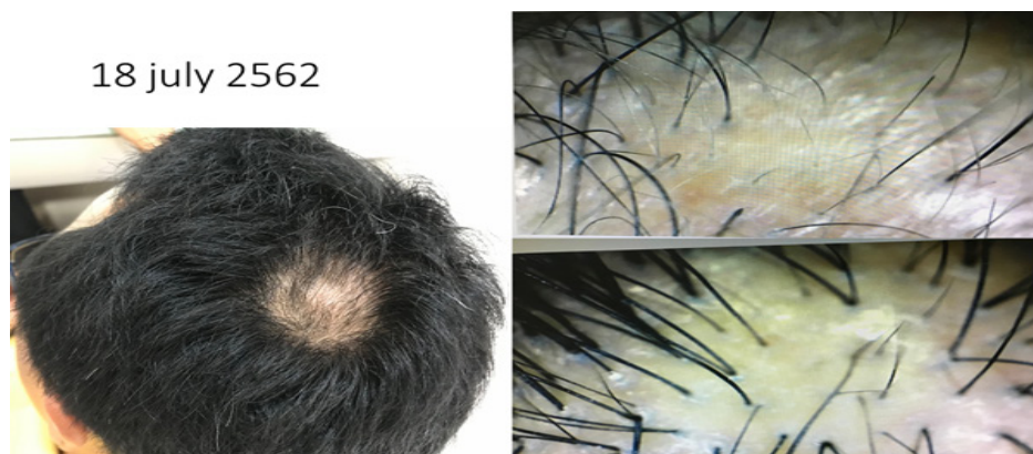
Figure 4 After using extracted cannabis oil to apply to all areas of hair loss, it was found that the hair grows quickly with a high density almost covering the alopecia areata area (July 18th, 2019.)

Abbreviation: alopecia, extracted cannabis oil