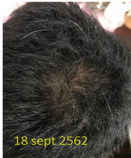
Figure 5 Hair grows and grows longer almost full area, after using extracted cannabis oil (September 18th, 2019.)

Notes: Dermatologists and patient concluded that the use of extracted cannabis oil for another 2-3 months to make the hair completely full as previous. Then, stop using.