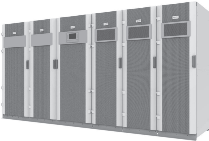
Figure 3 An example of a UPS with li-ion batteries is the Galaxy VX from Schneider Electric

It's well proven in scientific literature that temperature affects the service life of most components and batteries are no different. The rule-of-thumb for batteries (both VRLA and li-ion) is